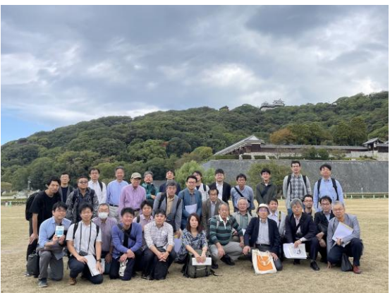
Fig.2 Conference at Ehime Regional Congress