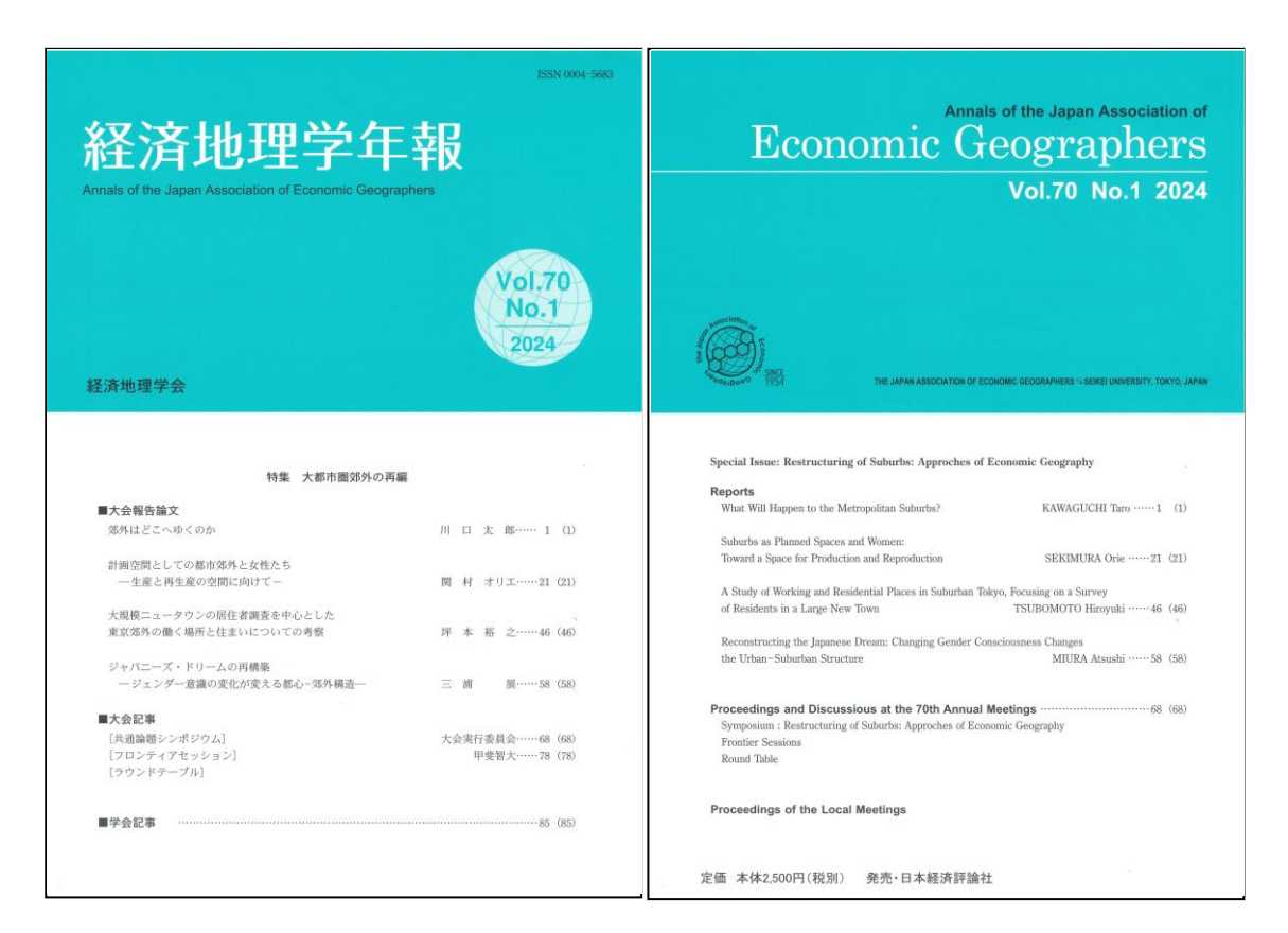
Fig.1 Keizai Chirigaku Nenpo Vol.70 No.1

The main activities of the Association consist of holding national and local meetings and publishing of Keizai Chirigaku Nenpo (AJAEG: Annals of the Japan Association of Economic Geographers : Fig.1) and some independent books like Kīwādo de Yomu Keizai Chirigaku ( Keywords in Economic Geography : published on June 2018 by Hara Shobo, Tokyo).